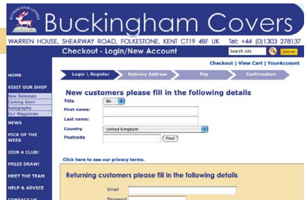
The Log In page

IMPORTANT NOTE: Do not use the 'Returning Customer' box just yet! Even though you maybe a regular Buckingham Customer, until you set up your online account our website won't know you yet!